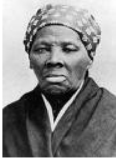
Harriett Tubman

later, a black woman named Rosa Parks refused to give up her bus seat to a white male passenger, and was charged with violating segregation laws. Eventually, in 1956, the segregation laws were successfully challenged in federal court and