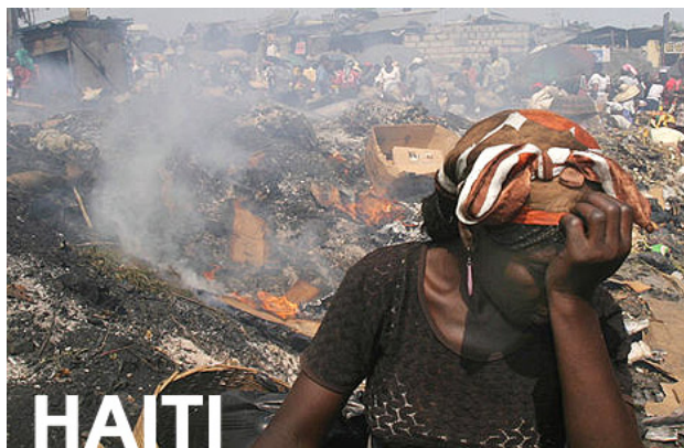
Distressed Haitians are enraged from the loss of their homes and loved ones

were in the middle of the adoption process before the earthquake struck and were relieved to hear that their children were okay and that they would be rushed through the adoption process and on their way to Iowa as soon as possible. This is one example of how Iowa families are making lemons into lemonade.